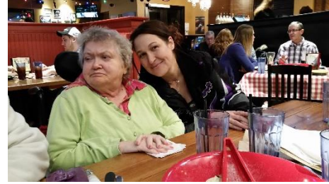
We enjoyed playing indoor "hockey" on the weekend. Even the assistants got into the game.