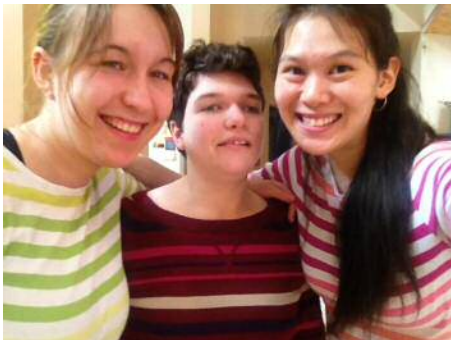
Galilee has started to dress alike