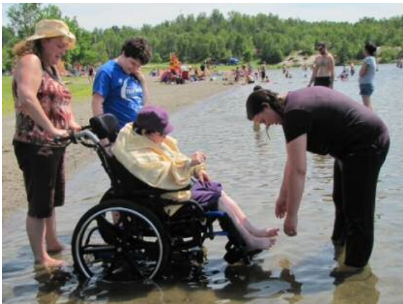
Galilee House had fun at the beach.