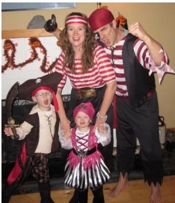
Who are these people??

Some of the best memories at L'Arche are made around the table....join us in making more!